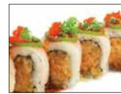
Snow White Roll