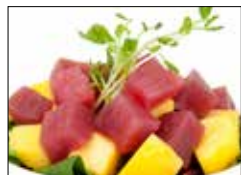
Tuna mango Salad

The images shown here are indicative only