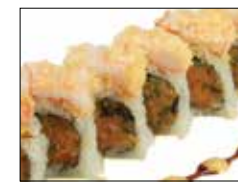
American Dream Roll