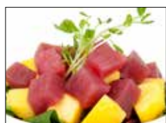
Tuna mango Salad

The images shown here are indicative only