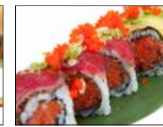
Crazy Tuna Roll