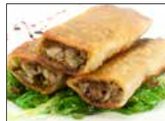
Crispy Duck Roll