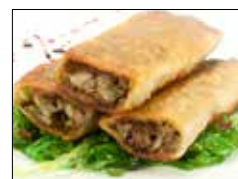
Crispy Duck Roll